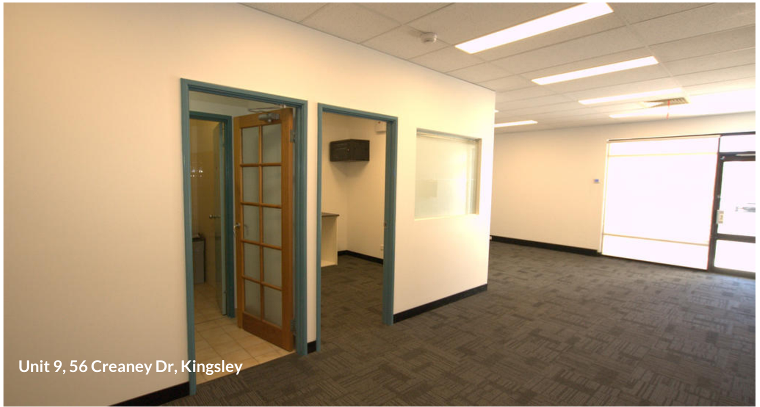
Unit 9, 56 Creaney Dr, Kingsley