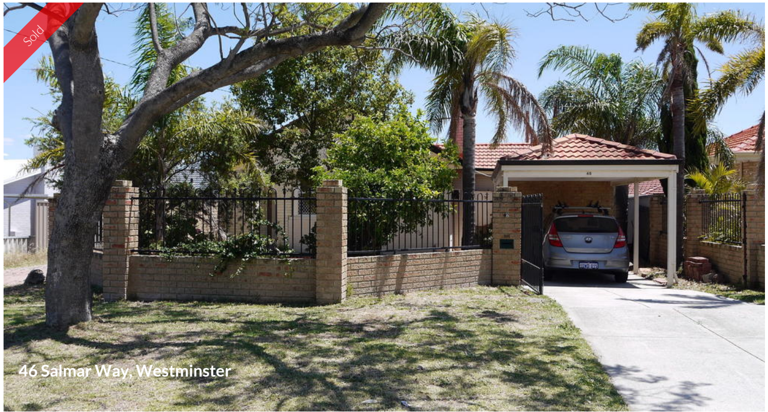
46 Salmar Way, Westminster